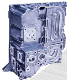
Gehäuse HV Booster Druckguss Westfalen GmbH & Co. KG, Geseke, GDA